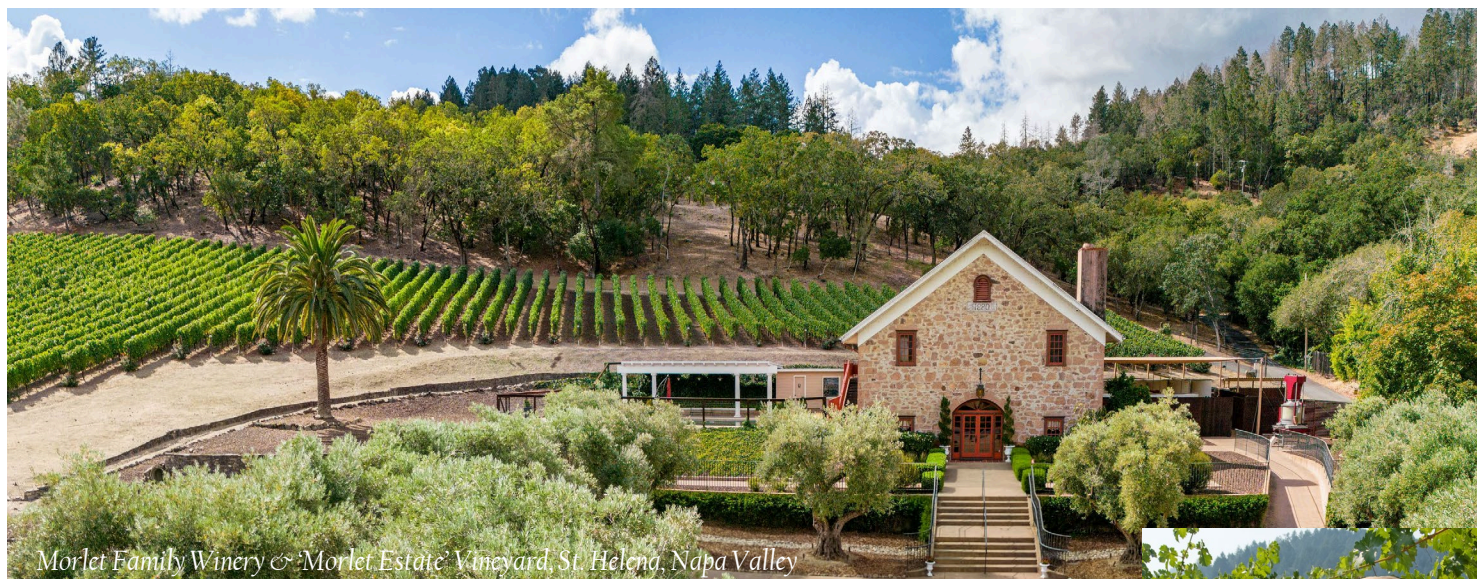
Morlet Family Winery & 'Morlet Estate' Vineyard, St. Helena, Napa Valley

'MANICURED VINEYARDS, CLASSICAL WINEMAKING & CREATIVE ARTISANSHIP'