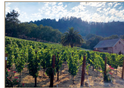
The steeper "Hillside"