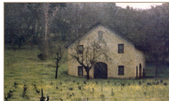
Left: The former Castner winery with the remnants of a vineyard, 1951 Right: The original 1880 stone plaque still remains on our winery

Planted with 100% Cabernet Sauvignon, our St. Helena property is the exclusive fruit source for our 'Morlet