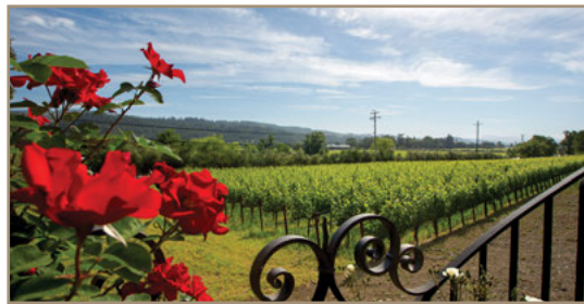
The lower "Foothills"

The 2-acre Foothills (planted by the previous owner)