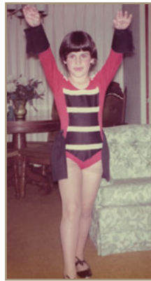
Before a tap show, Sacramento, 1976

G rowing up in California, I dreamed of dancing on Broadway, so my days were consumed with school and afternoon ballet, tap and jazz lessons. I still remember the entire tap routine to an Irish Jig which I performed when I was eight years old! Beginning at that same age,