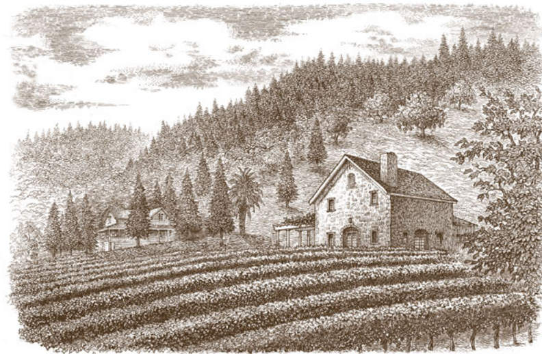
Our 'Morlet Estate' label depicts the 1880 Castner winery and 1853 farmhouse