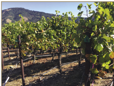
Imported from France in 1995, the Syrah 174 clone is known for its low cluster weight and low yields, resulting in balanced, aromatic wines with cherry fruit flavors.

Reims, the school hosted a graduation celebratory event, the white wine from Château Grillet was poured.