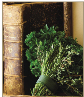
A bouquet garni next to Chef Coutanceau's "Le guide Culinaire" published in 1907