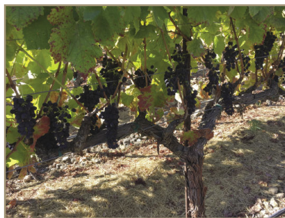
The Syrah 877 French clone lends a strong tannic grip to the mid-palate of the wine and is easily recognizable by its elliptical-shaped berries with softer skin.