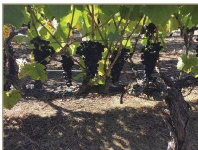
The highly-coveted Syrah field selection Estrella River comes from the cuttings of a famous vineyard in Hermitage and brings a rich quality to the wine.

the wings and shoulders from each cluster. Although not located on the famed Côte-Rôtie, Luc’s work on the vine canopy allows our grapes to be gently roasted by the sun. The three blocks are each planted with a different field selection of Syrah, so the resulting wine truly is a complex bouquet .