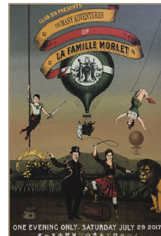
The commemorative Club 33 poster of 'La Famille Morlet'

Ellingson featured fourteen of our wines during the dinner. Our three Chardonnays accompanied a sautéed wild turbot and lobster pine nut risotto with yellow tomato and uni essence. Our three Pinot Noirs were complemented by English pea agnolotti, served with shaved Australian black truffles and chanterelles. Our white Bordeaux-style blend paired beautifully with a potato fennel cloud, braised rabbit, preserved lemon and elder flower. The fourth course consisted of bone marrow custard with a Kobe beef cheek marmalade. This was served with both our Cabernet Franc and the 'Bouquet Garni' Syrah. Three of our Cabernet Sauvignons were enjoyed with a Maple Leaf Farms duck breast with porcini dust and cherry confit. 'Morlet Estate' was singled out with a mountain lamb loin prepared with brambly vineyard essence. The evening ended with our Late Harvest white wine being poured alongside Canelés de Bordeaux and summer peaches. Executive Chef Andrew Sutton stated that when he first tasted our wines, he was amazed by their quality and felt intimidated creating a menu that would do the wines justice. That is quite a compliment coming from this award-winning chef! We are truly thankful that our wines are consistently featured at Club 33 and 21 Royal. Chef Sutton will be creating an exquisite dinner this March for the 4th Annual Napa in Newport wine auction benefiting CureDuchenne.