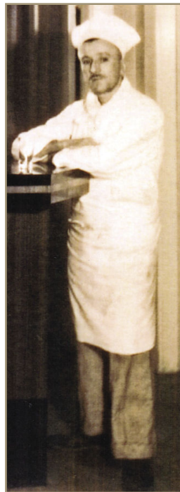
Chef Coutanceau, California, 1939

Turque' with boudin noir , glazed apple and spring onion mashed potatoes. The next course featured Chef Boulud's signature dish, duck à la presse with spinach subric, black trumpet and glazed turnip, alongside a 1983 'La Mouline' and both a 1979 and 1989 'La Landonne'. The Rhône portion of the luncheon concluded with a 2003 Domaine J. L. Chave, Hermitage complemented by roasted duck leg with whole foie gras, walnut vinaigrette and young mesclun. Almost seven years later, Luc still talks about the Vallée du Rhône wines which he tasted that day!