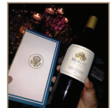
Our harmonious blend is served at a State Dinner.

We feel privileged that this wine has been served at The White House on numerous occasions under both the George W. Bush and Barack Obama administrations. For a dinner in which President Bush paid tribute to the Combatant Commanders, The White House Chef and Head Usher paired our inaugural 2006 vintage with a Gratin of Chesapeake Crabs. Shortly thereafter, our first vintage was also chosen for a luncheon offering guests a Maine Lobster Bisque with Chive Truffle Beignets and a Seared Virginia Striped Bass with Porcini Espuma, Crushed Potatoes, Braised Leeks and Swiss Chard. The 2007 vintage complemented a Spinach and Artichoke Ravioli with Lemon Emulsion and Shaved Virginia Ham Cracklings, when President and Mrs. Obama hosted the President of the French Republic Nicolas Sarkozy and his wife Carla Bruni-Sarkozy. The Governors of the States and Territories enjoyed the 2010 vintage alongside a Seafood Cocktail with Spiced Gulf Shrimp, Mussels and Kumamoto Oyster, with Baby Cucumber and Pickled Watermelon Rind. At the State Dinner honoring current French President François Hollande, the 2011 vintage was selected for a Winter Garden Salad with Petite Mixed Radish, Baby Carrots, Merlot Lettuce and Red Wine Vinaigrette. We look forward to seeing the food and wine pairings to come!