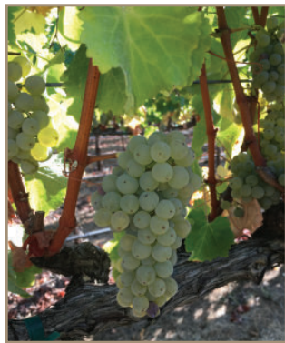
The Musqué Sauvignon Blanc brings structure, zest and intense fragrances to the cuvée .

Our Sauvignon Blanc vineyard is comprised of two blocks. The Musqué clone is known for bringing strong aromatics to the wine, while the Preston field selection expresses the mineral character of the terroir and provides the wine’s acidic structure. The dry-farmed Muscadelle vineyard was also planted in the 1950s. This 65 year old vineyard has no training system. It is “head-pruned” meaning that the fruit grows only from the spurs and