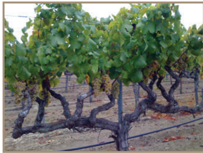
The old Sémillon vines’ roots plunge deep into the loamy soil and contribute to the texture and depth of ‘La Proportion Dorée.’

Luc discovered a dry-farmed Sémillon vineyard. Established in 1953, these old vines are planted in loamy to gravelly soils. He farms this land in the same manner as our Cabernet Sauvignon vineyards, thinning the crop to just one cluster per shoot and downsizing each cluster by removing the wings, shoulders and tip. Our Sauvignon Blanc vineyard is comprised of two blocks. The