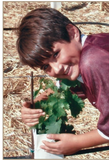
Proud of the vine he planted