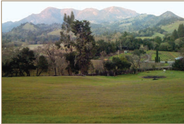
Before vineyard development