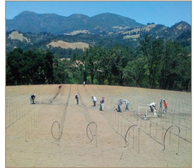
Planting the Cabernet Sauvignon vines