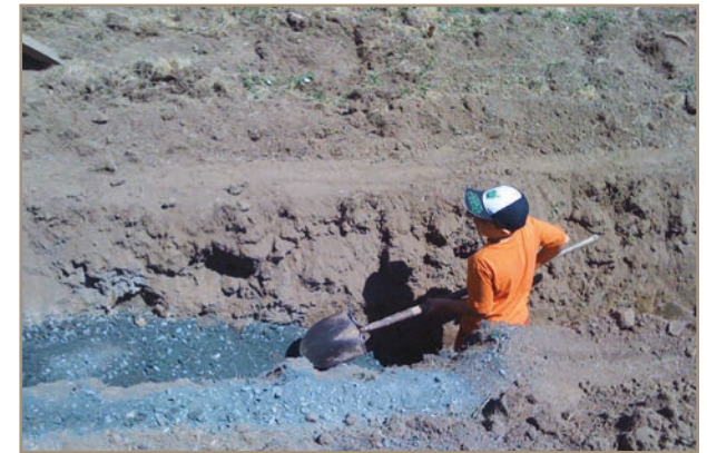
Paul (wearing a Star Wars hat) works in a drainage ditch