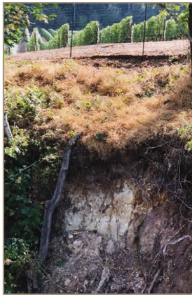
Geological profile naturally visible from Bidwell Creek

per acre) results in competition among the vines, which in turn produces petite berries, tiny clusters, and an overall smaller crop. The rectangular 3/4 by 6 foot spacing facilitates proper airflow, naturally limiting pest and fungus development, while providing full sun exposure to the canopy. This perfect combination of soil, elevation and spacing en-