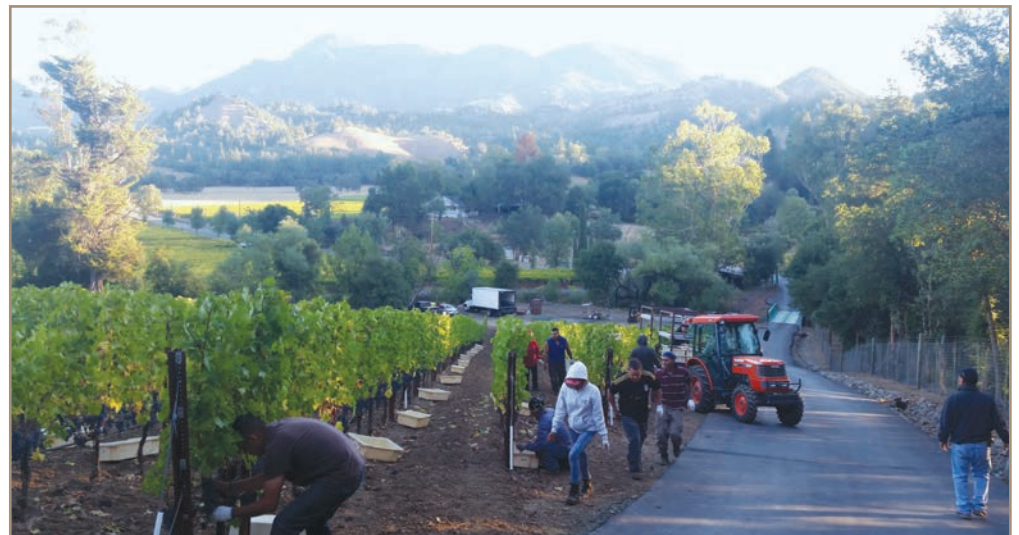
Picking at first light, October 2014