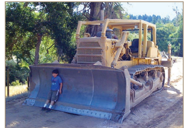
Paul (wearing a Star Wars shirt) uses the "Force" to control the bulldozer