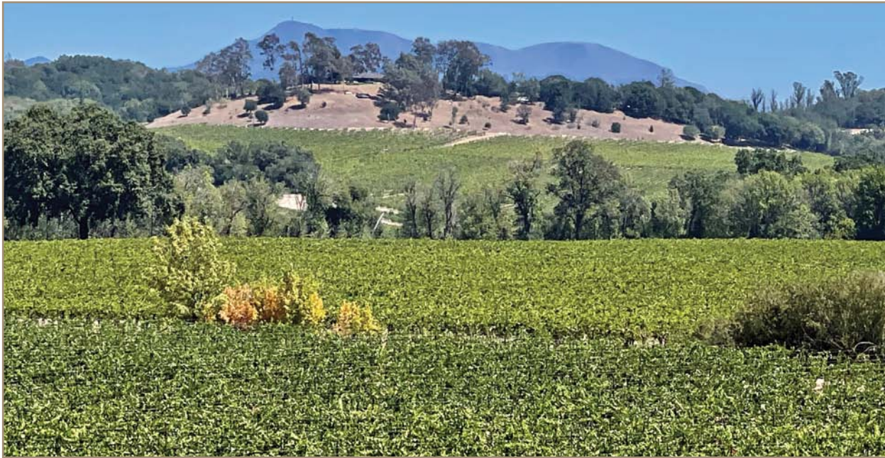
Mount St. Helena overlooks the vines for our 'Ma Princesse' Chardonnay, Russian River Valley

that's classic Russian River Valley all the way." Lisa Perrotti-Brown described our 2017 as having "delicate notes of lemon meringue pie, white peaches and lime leaves plus emerging nuances of wet slate, paraffin wax, struck flint and croissant with a waft of praline. Medium to full-bodied, the palate is tightly wound and packed with taut citrus and mineral layers, framed by a fantastic freshness and a satiny texture, finishing wonderfully tangy."