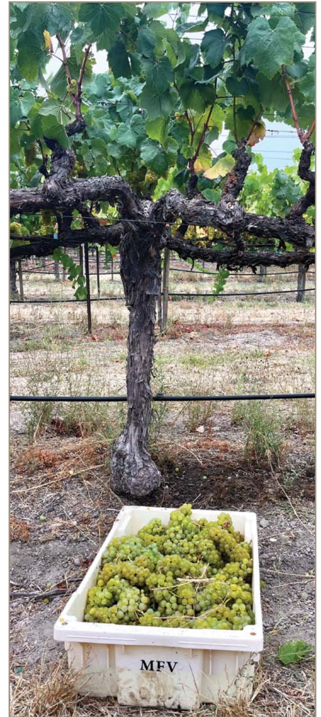
Right, 'Ma Princesse' harvest, fall 2022