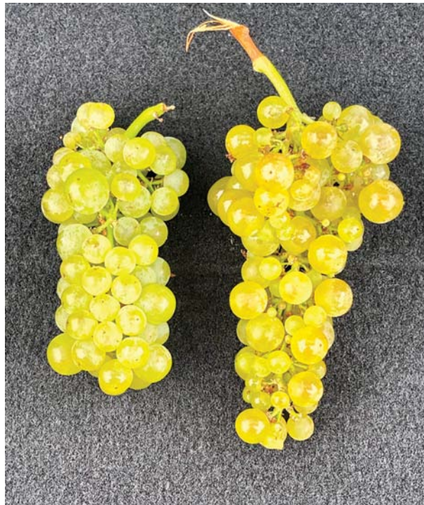
Left, The Old Wente field selection is characterized by the "chicks and hens" size of berries