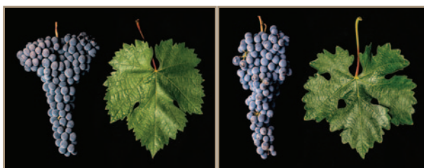
Cabernet Franc (left) & Cabernet Sauvignon (right) are related, yet different, 'Cœur de Vallée' vineyard, 2019