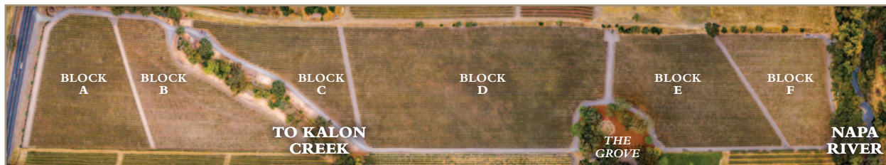
Blocks B and F of our 'Cœur de Vallée' vineyard are planted exclusively to Cabernet Franc

Cabernet Sauvignon is the offspring of Cabernet Franc and Sauvignon Blanc, which resulted from a cross-pollination between the white and red varieties. Although visibly different in shape, the leaves of both Cabernet Franc and Cabernet Sauvignon are five-lobed.