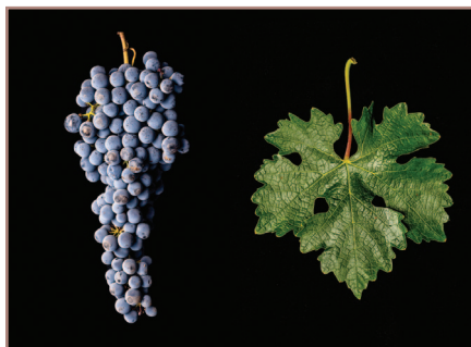
Cabernet Sauvignon cluster & leaf from 'Cœur de Vallée' Vineyard, Harvest 2019