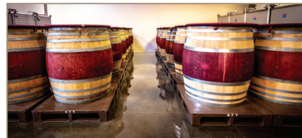
Cabernet Franc macerates in open-top Darnajou puncheons and small stainless steel tanks