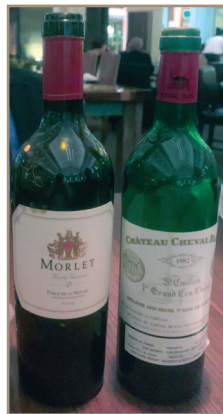
The 2010 ‘Force de la Nature’ & 1982 Château Cheval Blanc mark the special occasion