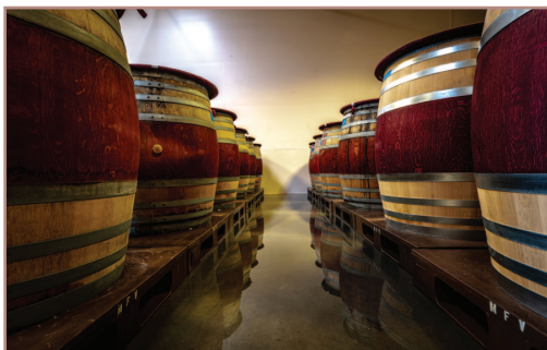
One-third of our red wines naturally ferment and macerate in gueule-bée barrels