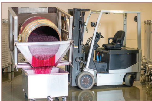
The Gyrobox™ drains a puncheon after fermentation and maceration are completed

characteristics of each harvest. Aged exclusively in French oak barrels from selected artisan coopers, the wines are bottled unfiltered and unfiltered. Luc's unwavering commitment to quality leads to small yields, attentive sorting, and the highest standard when blending. Thus, a very limited amount of each wine is ever produced.