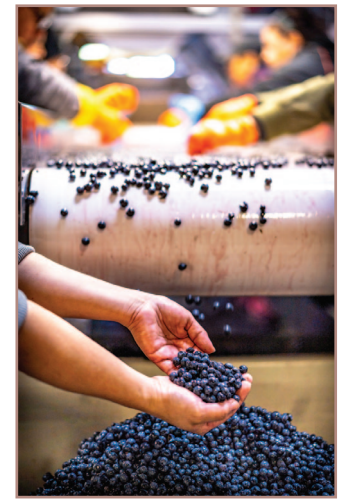
A berry per berry sorting team of 10 individuals results in the highest quality of fruit possible

this device, operated with a forklift, drains the puncheons. Instead of pumping out the wine over the course of an hour, Luc's innovative design uses only gravity. This gentler method preserves the wine's aromatics and also reduces the time spent to only twenty minutes.